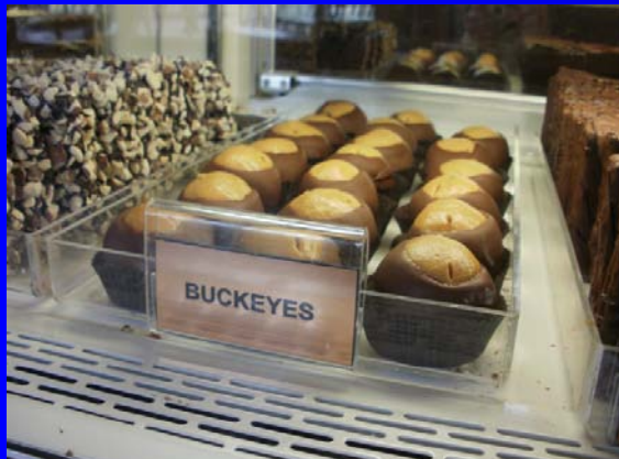
This is a great example of the Westlake store showing products that are particular to their region and their store. Fans will relate to this item and it gives the store an identity.