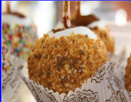
Apple photos from the El Centro Cold Stone and RMCF. These are beautiful photos that make you feel as if you are in the store.