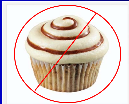
Don't worry, this doesn't mean that you can't have any stock photos on your Page. Stock photos are helpful in showing the array of products you offer. But stock photos aren't nearly as appetizing or appealing as the real photos. This stock cupcake photo from Cinnabon's Page looks almost fake and doesn't produce nearly the effect of the other photos here.