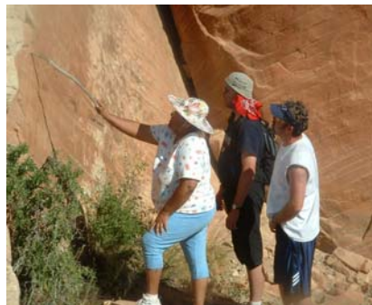
Checking out the petroglyphs