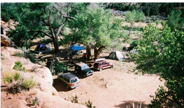
The EDGE Camp Site