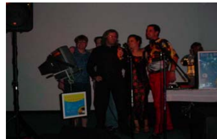
“Lean on Me”