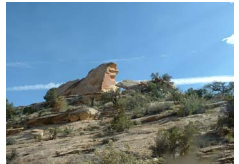
Some of the crew hiked to the top of "Pride Rock"