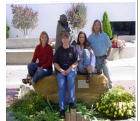
New EDGE Staff