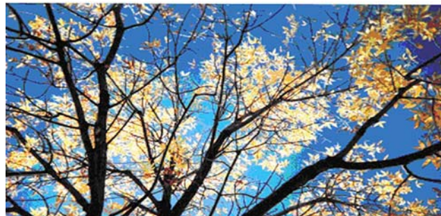
"The Changing of the Season"