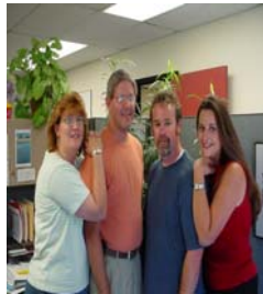
Old EDGE Staff