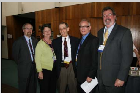
2007 Technology Conference

"The understanding and use of technology has become a necessity in our lives. Today's professionals need to find opportunities to broaden their vision and find ways to use technology to enhance their worlds."