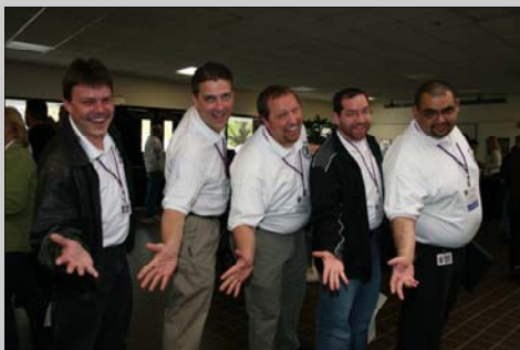
San Juan College IT Staff