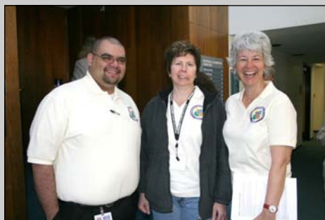
San Juan College IT Staff