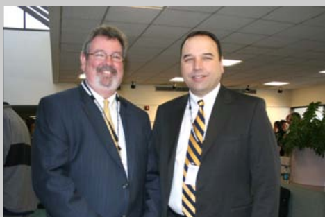
2008 Conference Presenters

"The understanding and use of technology has become a necessity in our lives. Today's professionals need to find opportunities to broaden their vision and find ways to use technology to enhance their worlds."