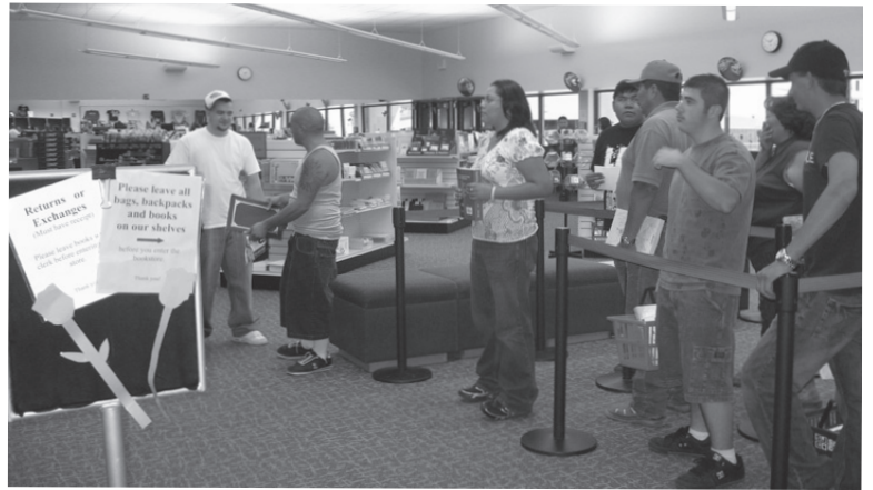
Students line up the SJC Bookstore to purchase their Fall semester books and supplies

All students are encouraged to stop by the fair. The fair will have a prize drawing, food and entertainment. There will also be gifts for students who drop by the Volunteer Center table.