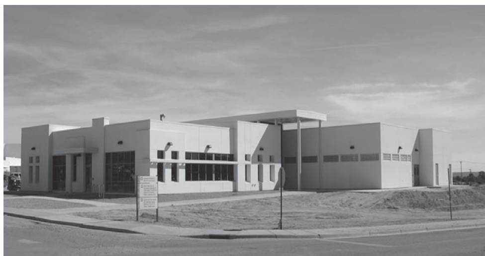
Newly built Simulation Center on campus, located across the street from the HHPC

The center is equipped with a completely functioning Emergency Room, Intensive Care Unit, Operating Room, Medical Lab, Microbiology Lab, Decontamination and Sterilization Lab. A skills lab and classroom are also housed in the