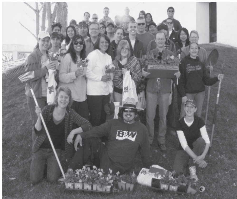
The Spring Yard Clean-up crew in 2010.