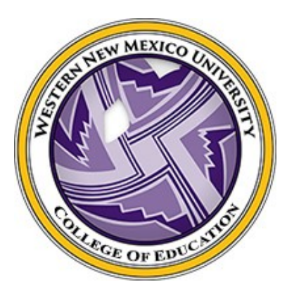
Only fully online accredited leadership & education program.